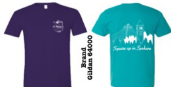
Men's T-shirt (C)