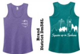
Women's Tank Top (B)