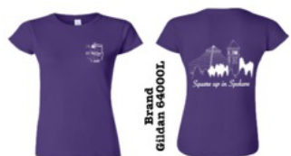
Women's T-Shirt (A)

T-Shirts Style A & C: S-XL $28 | 2XL $32 | 3XL $36 Tank Tops Style B: S-XL $31 | 2XL $37 | 3XL $42